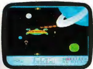
MOTHER SHIP ARRIVING

When your Spectron is about to run out of fuel, your Mother Ship will appear, preceded by several musical notes. When this ship appears, be prepared to intercept the Energy Pack that will be dropped by parachute. In order to refuel, you must catch this pack by moving your Base Laser so that it is directly below.