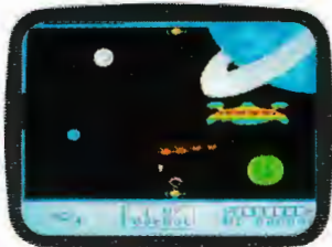
CATCHING ENERGY PACK